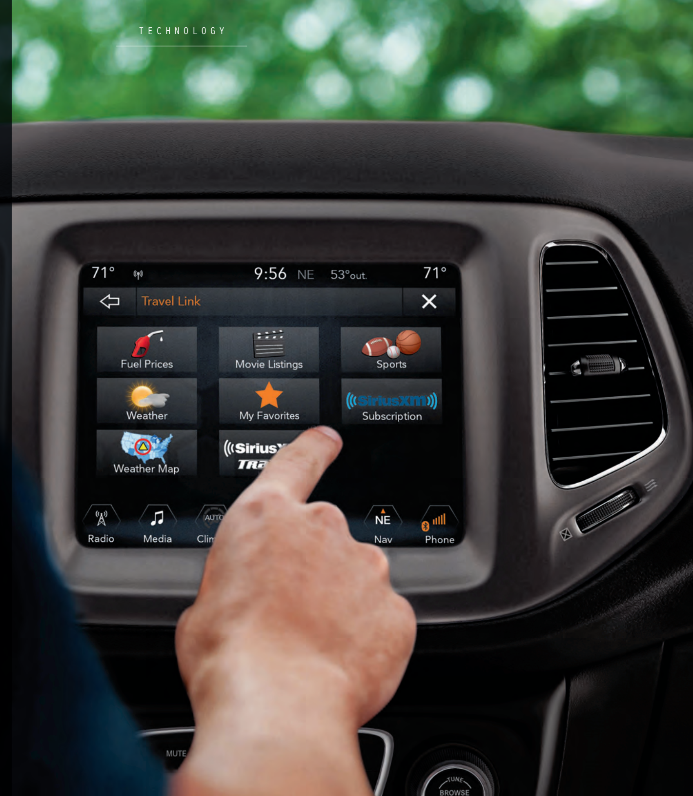
IMAGE IS FOR ILLUSTRATIVE PURPOSES ONLY AND MAY NOT REFLECT EXACT SOFTWARE FOR YOUR VEHICLE.

SIRIUSXM TRAFFIC PLUS18 AVOID CONGESTION BEFORE YOU REACH IT. GET CONTINUOUS UPDATES ON TRAFFIC SPEED, ACCIDENTS, CONSTRUCTION, ROAD CLOSURES AND MORE, BEFORE YOU BEGIN YOUR TRAVELS. YOU WILL GET TO YOUR DESTINATION FASTER AND MORE EASILY THAN EVER BEFORE. YOUR FIRST FIVE YEARS OF SIRIUSXM TRAFFIC PLUS18 SERVICE ARE INCLUDED. AVAILABLE.